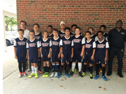
Boys Soccer Team

Halloween Guessing during the morning of October 31st , begins just after 8:30 a.m. in the auditorium. Students and teachers try to guess who is in each costume... and there's always one student who stumps the crowd! Again, parents are welcome to attend and bring your cameras!