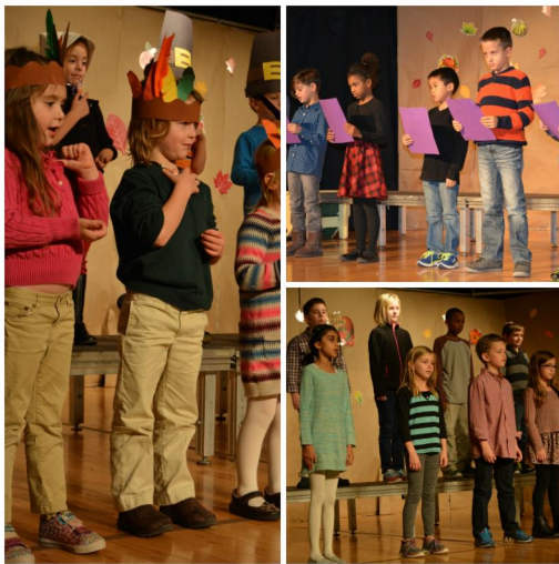
Thanksgiving Concert 2015