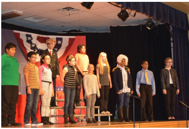
"See How They Run"