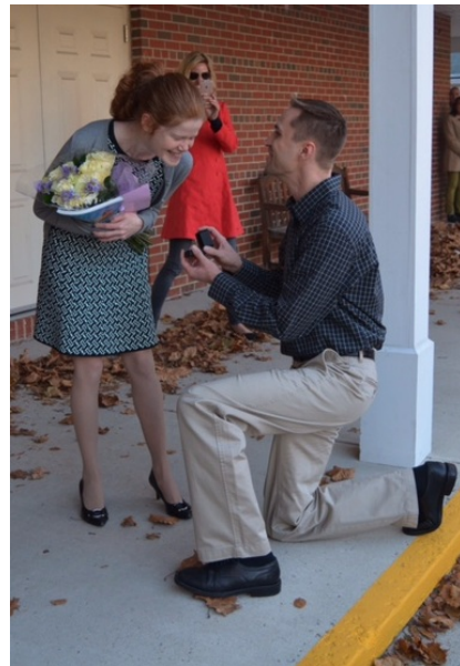
She said YES!