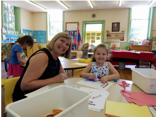
Grandparents & Special Friends Day

* p.s. for more details about the Westfield Tree Walk, see our website at: http://westfieldfriends.org/about-us/tree-walk/