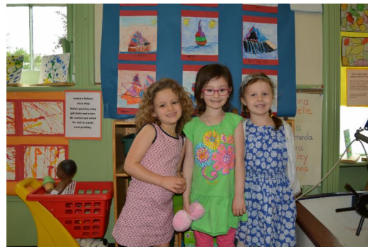
Pre-K Gals at the Art Show!