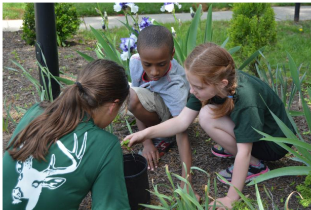
Spring Clean Up Day