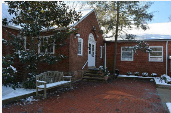
First snow of 2017!