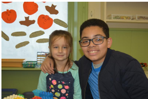
Pre-K and 6th Grade Buddies

Many thanks to everyone who has donated to the 2016-2017 Annual Fund to date! We are hearing from so many families, alumni and new donors this year! In addition to the monetary gifts, we are also having some wonderful conversations with donors about why they support Westfield and some very entertaining stories of past escapades and classroom shenanigans!