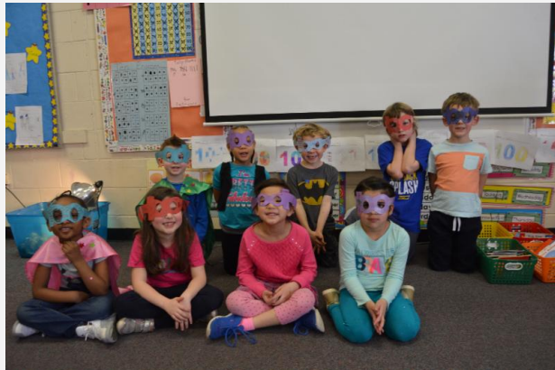
Celebrating 100 Days of School in Kindergarten!

We survived our first Snow Day on February 9th, always a nervous morning for any head of school considering the impact on our families... the call was made easier since most schools in our region were also closed, but never an easy call, nonetheless.