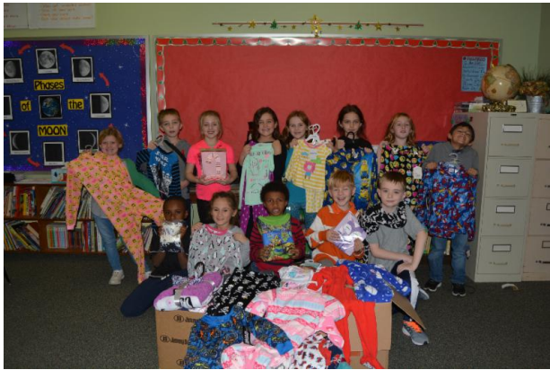
Second Grade Says Thank You!