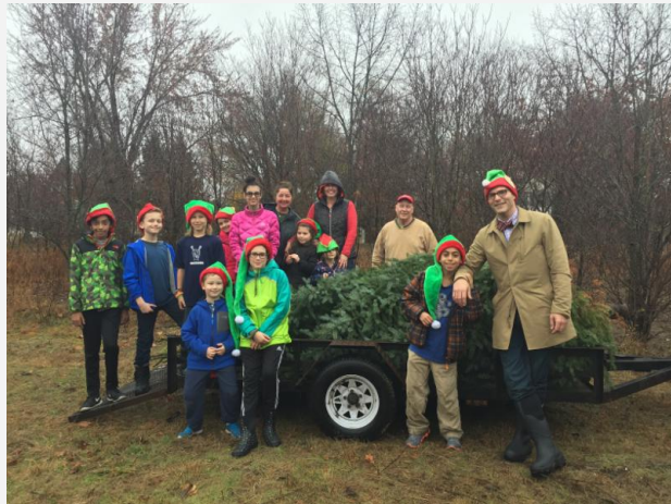
Christmas Tree Cutting at Kenlin Tree Farm