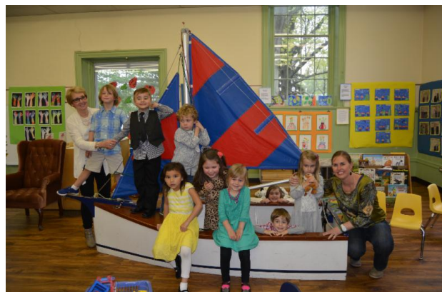
Pre-K Art Show - May 2016