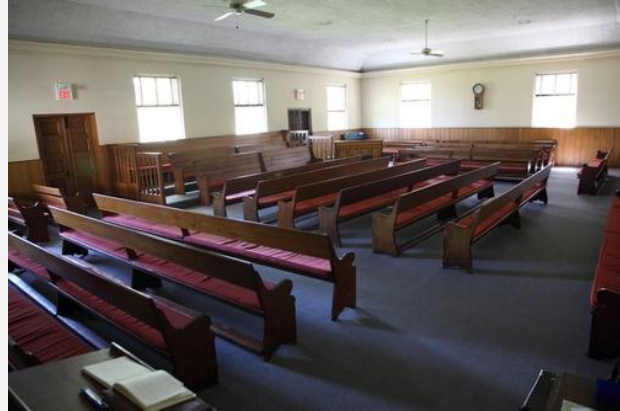
Westfield Friends Meetinghouse

Quaker Query 3: Spiritual Nurture, Ministry, and Religious Education